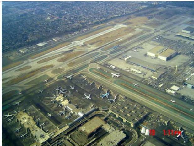
Van Nuys, CA "16-Right"