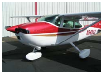
The New Skylane! page 2