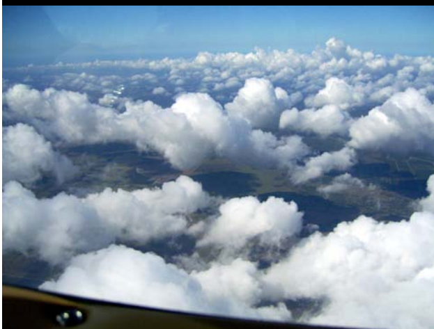
Above the Clouds en route to Spruce Creek