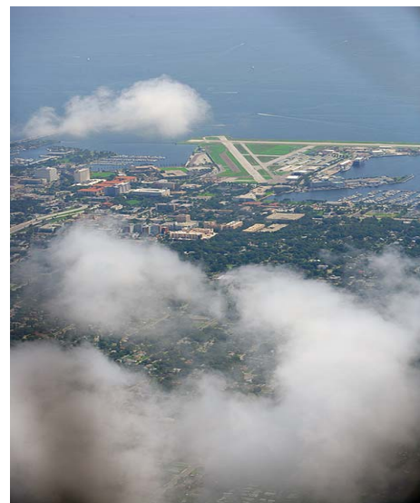
Approaching Albert Whitted (KSPG) through a scattered cloud layer

Got an in-air photo from one of our Club planes that you want to share with other members? Send it in!