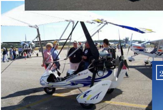
2007 Aviation Day