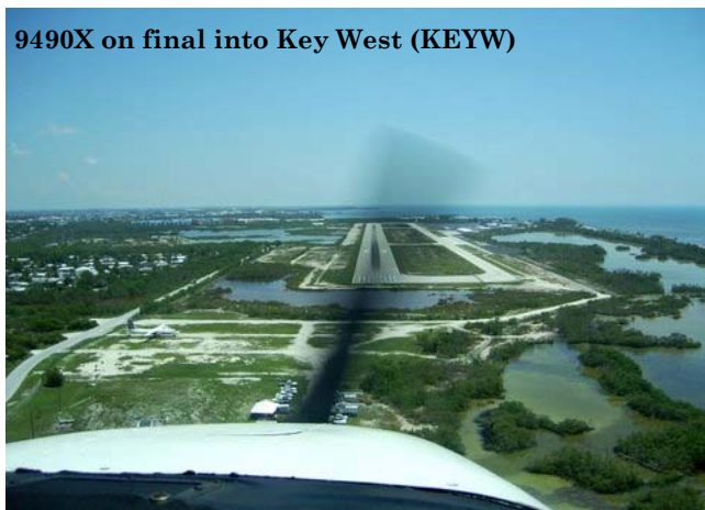
9490X on final into Key West (KEYW)

Got an in-air photo from one of our Club planes that you want to share with other members? Send it in!