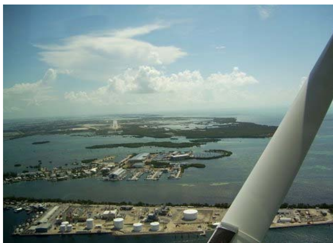
9490X Climbing out, Runway 9, Key West (KEYW)

Got an in-air photo from one of our Club planes that you want to share with other members? Send it in!