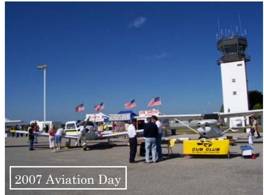
2007 Aviation Day

From different rotorcraft and fixed wing piston aircraft all the way up to very cool jets. You can even buy a ride in a helicopter and see the City and the River from the air! It is a great place for the whole family to spend the day, and it gets bigger and better every year. The Cub Club will certainly be there again this year, with our Cessna 172 Skyhawk, One of our Piper Archers, and our Cessna 182 Skylane. We will also be offering a membership special too! So mark your calendars and don't miss the big event this year! See you all there!