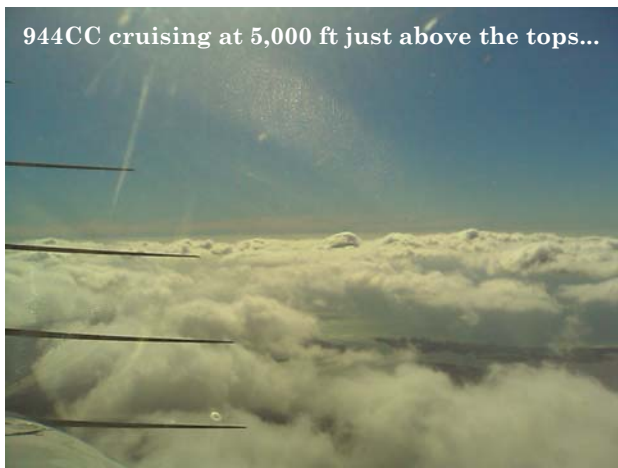
944CC cruising at 5,000 ft just above the tops...