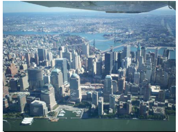
NYC Ground Zero

We took off from PWM on Tuesday Oct 7 th and flew 1.3 hours to BAF in Massachusetts where the cheapest fuel could be obtained. Aviation gas price had peaked during the previous month but it still took careful planning to minimize cost. The weather looked excellent all down the coast and we headed for Hampton Roads via New York City. We flew VFR with Flight Following, as Joe explained, "I like to be talking to somebody all the way." The best experience is flying down the Hudson at 2000 feet. We were to have been at 1500 feet but a Piper J-3 was going north at 1500, we were given 2000. With New York on the