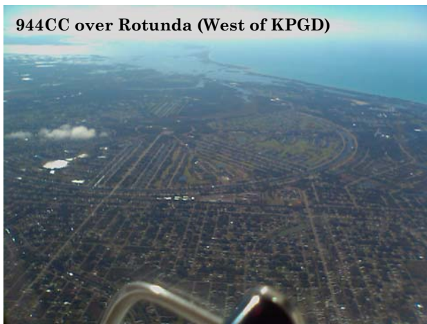
944CC over Rotunda (West of KPGD)