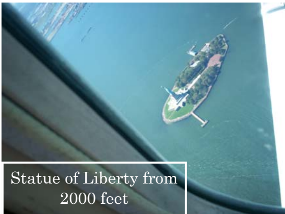
Statue of Liberty from 2000 feet