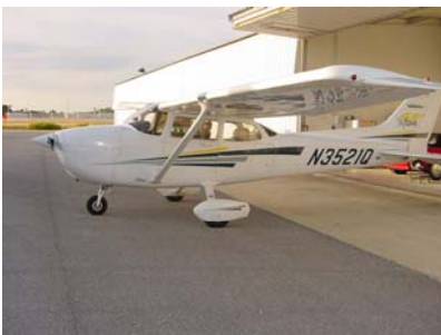
Cessna Skyhawk 172 N3521Q