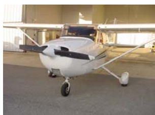
The New Skyhawk! Page 2