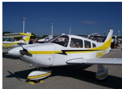
Piper Archer 181 N944CC