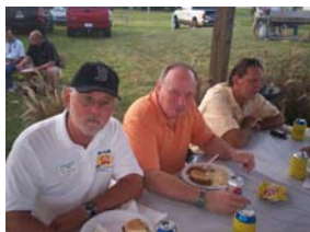
Club BBQ Page 1