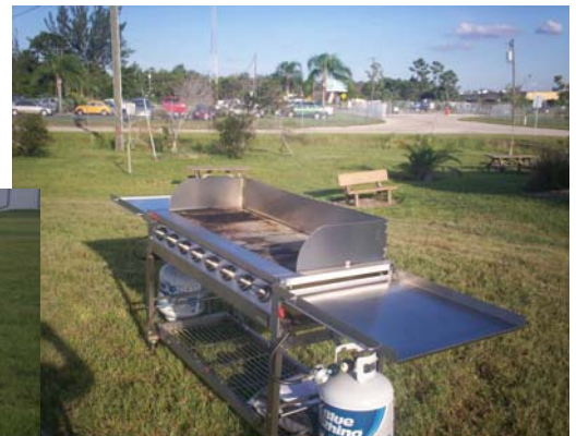
The Shiny EAA BBQ

If you missed this one, you missed a good one!