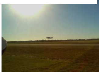
Liberator Take-off! Page 1