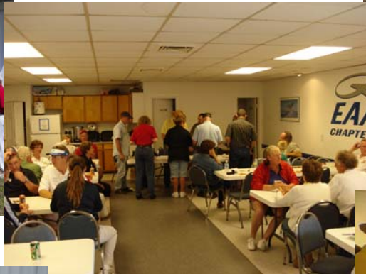
The cards were "flying!"