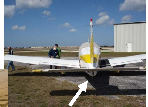
Psssttt..... Look in the Tail.....!!!

Overall, it was another great Poker Run event, and everyone had a lot of fun. If you missed this event this year, make sure you join us next time!