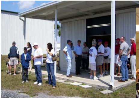
Burgers Were Great!