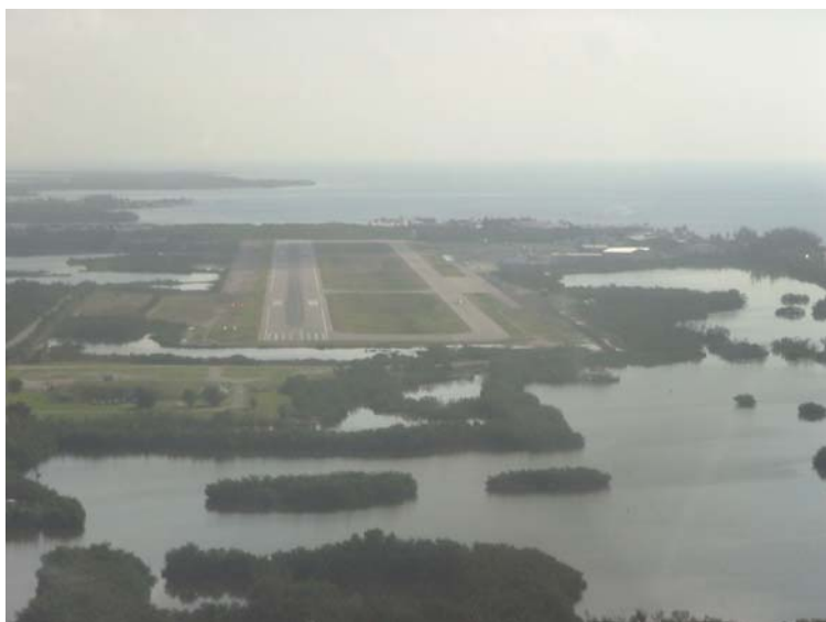
Skyhawk 21Q on final approach in the Florida Keys