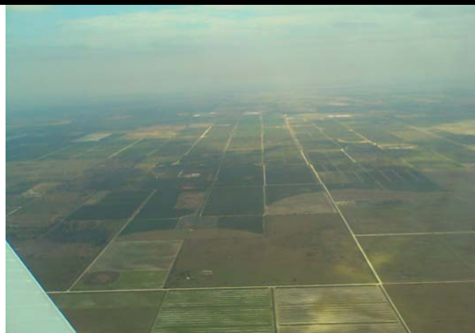
944CC Flying in a previous Poker Run, near Arcadia (X06)

Got an in-air photo from one of our Club planes that you want to share with other members? Send it in!