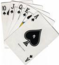
Annual Poker Run! Page 1