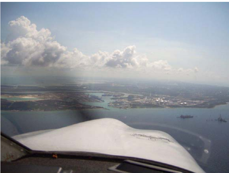
Archer 944CC on final into Freeport, Bahamas (MYGF)