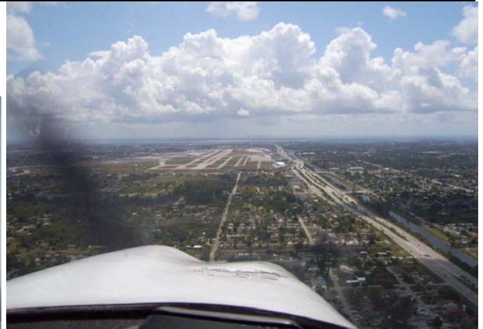
944CC Short final into PBI, Runway 10-R Pilot: Terry Voorhees

Got an in-air photo from one of our Club planes that you want to share with other members? Send it in!