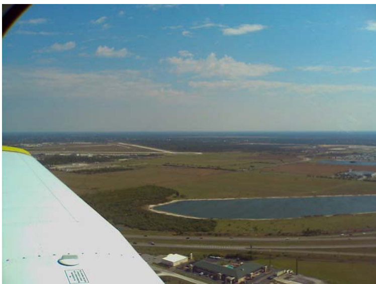
Archer 944CC on a long left base to Charlotte County (KPGD)