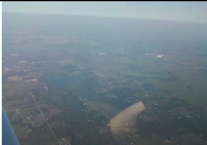
944CC at 7,000 feet near Lakeland

Got an in-air photo from one of our Club planes that you want to share with other members? Send it in!