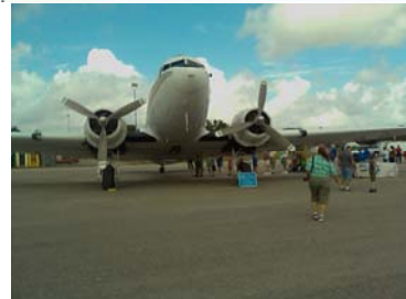
Aviation Day Coming 11/5! Page 1