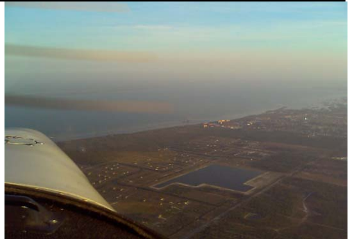
944CC along the coast heading for Venice (KVNC)

Got an in-air photo from one of our Club planes that you want to share with other members? Send it in!