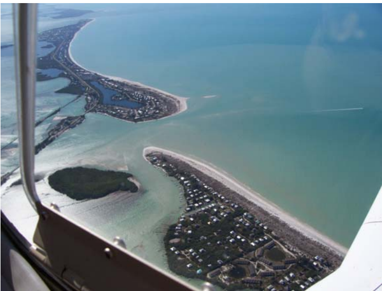
Archer 944CC near Boca Grande Pass