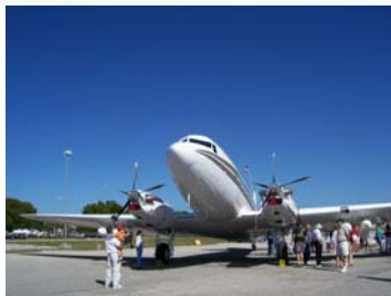
Aviation Day 2011 Page 1