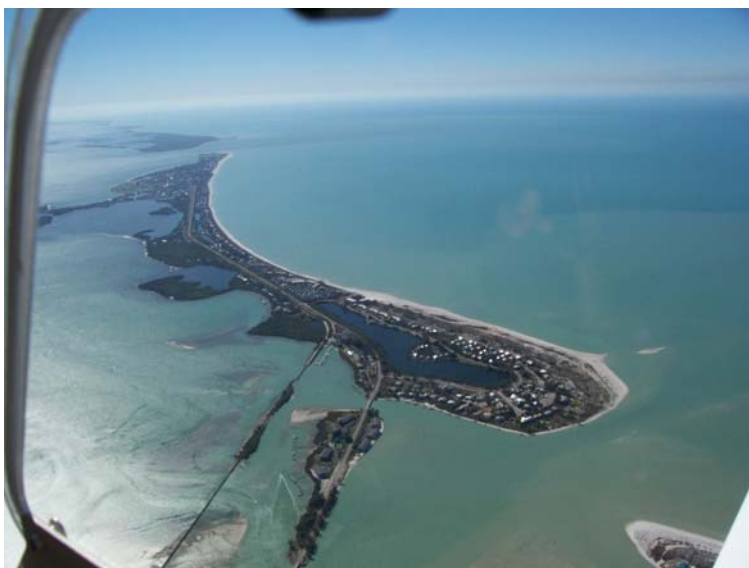
N944CC along the Coast near Boca Grande Pass