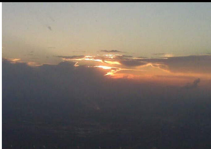
A SW Florida Sunrise seen from the Skyhawk

Got an in-air photo from one of our Club planes that you want to share with other members? Send it in!