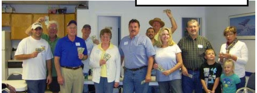
PREVIOUS POKER RUN WINNERS!