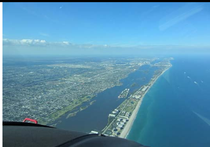
N9490X approaching West Palm Beach Airport

Got an in-air photo from one of our Club planes that you want to share with other members? Send it in!