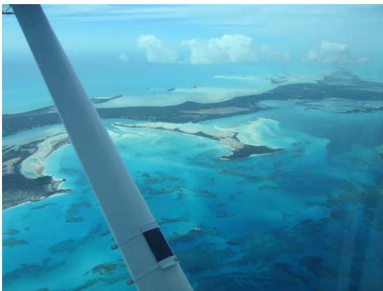
N9490X over one of the Bahamas Islands Pilot: Bojan Belovic