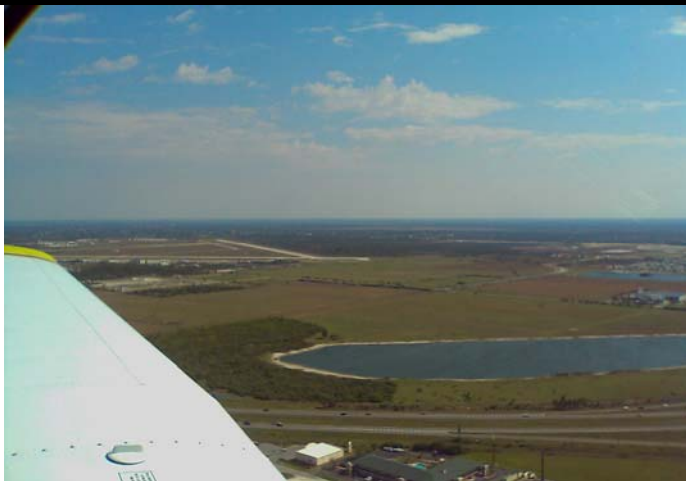
N944CC Flying the Poker Run

Got an in-air photo from one of our Club planes that you want to share with other members? Send it in!