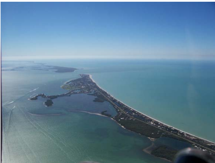
N944CC Approaching Boca Grande Pass