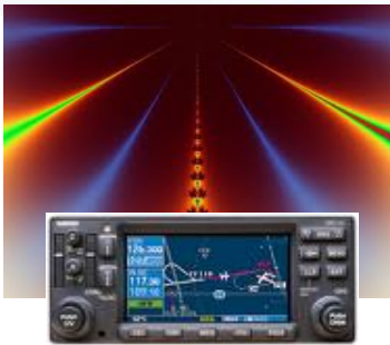
Garmin 430 WAAS! Page 1