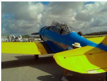
Aviation Day Coming Soon! Page 1