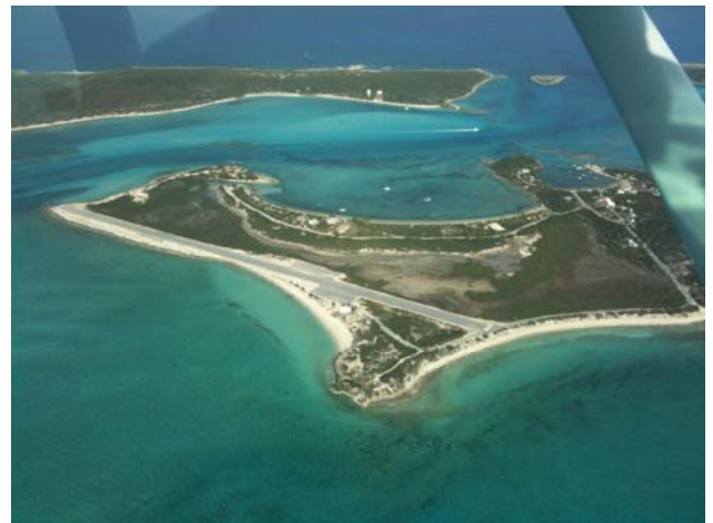
9490X on left base to an island runway

Got an in-air photo from one of our Club planes that you want to share with other members? Send it in!