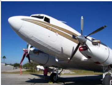
Awesome Aviation Day! Page 1