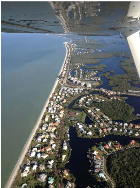
3521Q over Barefoot Beach