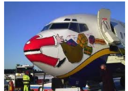
Some Aviation Holiday Humor!

Got an in-air photo from one of our Club planes that you want to share with other members? Send it in!