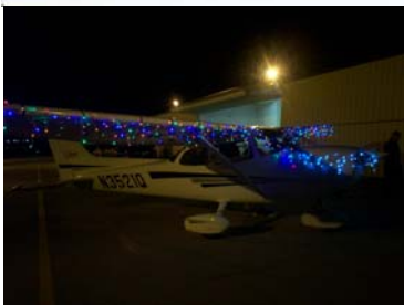
Hangar Party 12/14! Page 1