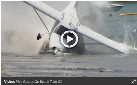
Video: Pilot Crashes On Beach Take-Off

Pilot makes safe emergency beach landing only to crash on take off