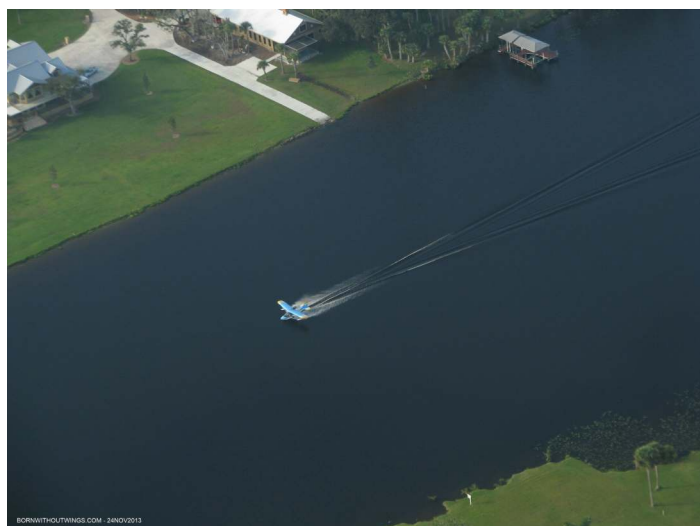
Seaplane splashes down in the Caloosahatchee

Photo by Waner Del Rosario taken from N3521Q