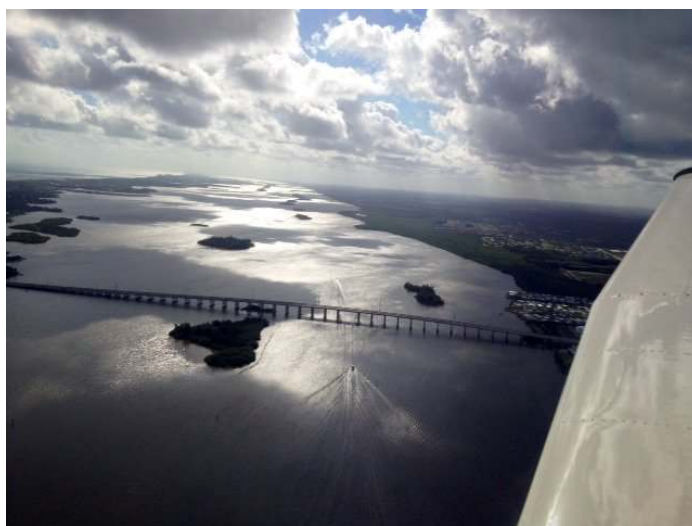
Climb-out from Vero Beach (KVRB), looking south over the Indian river.

Photo by Waner Del Rosario taken from N3521Q